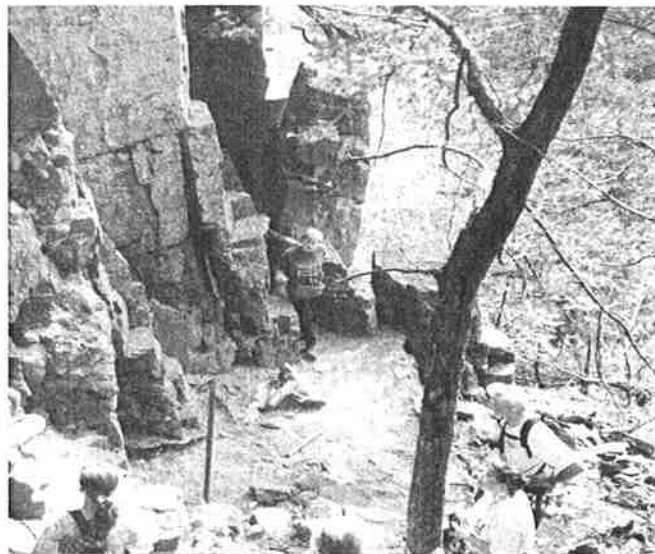
Hiking near Devil's Doorway

As always, volunteers are necessary to ensure a smooth running and safe event. Help is always needed for check points. If you would like to volunteer to help make our events a success, please contact Badger Trails, Inc. through the Internet at: www.badgertrails.org or email at: info@badgertrails.org .