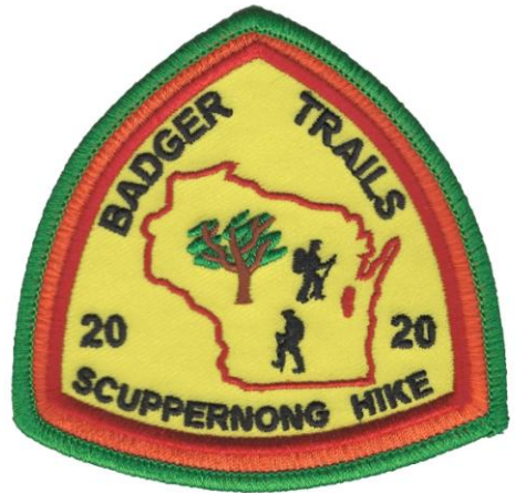
Last Year's Patch

Badger Trails, Inc is a nonprofit hiking organization that promotes hiking on historic trails in Wisconsin. Individuals, families or any organized youth group may participate. Badger Trails members are volunteers who enjoy hiking and outdoor events. They have a desire to promote and share these experiences with today's youth and their families.