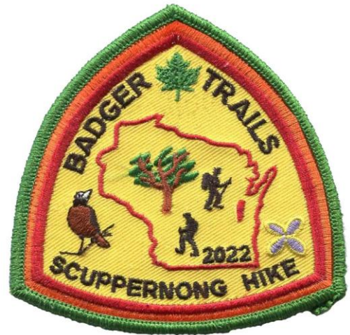
Last Year's Patch

Badger Trails, Inc is a nonprofit hiking organization that promotes hiking on historic trails in Wisconsin. Individuals, families or any organized youth group may participate. Badger Trails members are volunteers who enjoy hiking and outdoor events. They have a desire to promote and share these experiences with today's youth and their families.