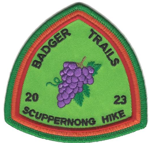
Last Year's Patch

Badger Trails, Inc is a nonprofit hiking organization that promotes hiking on historic trails in Wisconsin. Individuals, families or any organized youth group may participate. Badger Trails members are volunteers who enjoy hiking and outdoor events. They have a desire to promote and share these experiences with today's youth and their families.