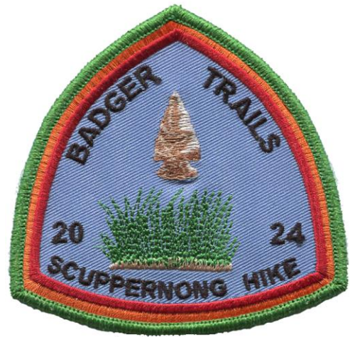
Last Year's Patch

Badger Trails, Inc is a nonprofit hiking organization that promotes hiking on historic trails in Wisconsin. Individuals, families or any organized youth group may participate. Badger Trails members are volunteers who enjoy hiking and outdoor events. They have a desire to promote and share these experiences with today's youth and their families.